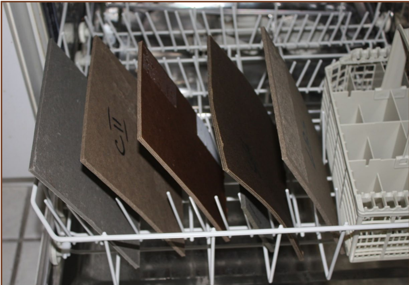
Paperboards after completed dishwasher test. Identical .120 calipers used. Only the chip board distorted.

an entirely new experience. I have no idea what our highly skilled paperboard people and scientists think about such a very unusual paperboard test. For an honest comparison, I selected five other brands of paperboards as well: a binders board, an unknown cover board sent by a library binder in the re-certification process, laminated boards and a chip board. Only the chip-board distorted and disintegrated. The high quality laminated board structure came apart, most likely because the water dissolved the adhesive used. The binders board, an embossing board, the unknown board and this all-new cover board had almost identical results. After drying, they were all equally slightly distorted. In other words, I believe that such a dishwasher challenge is a useless cover board test, unable to help us reach any valid conclusions.