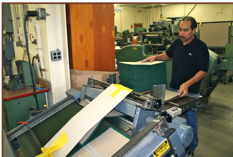
Cover de-warping as observed at the HFGroup-Acme Bindery.

inches, and mounted a single sheet of an endpaper onto one side only. After drying for a few days, the cover board warped as expected, lifting the edges upwards 3/8 inch. If I had mounted the same paper onto both sides, using the same grain direction and casing-in adhesive, that board would lay flat on the table, as I would have put equal forces to work. Of course, that isn't really possible. To construct a book-cover, we may have a cross-grained, laminated paper on one side and an endpaper on the inside. The covering material is glued onto the board with hot protein glue, the casing-in adhesive is a water-based PVA. In some cases there may be cloth on the outside and a laminated endpaper on the inside. That laminated endpaper will not expand and pull the cover inward as expected, usually resulting in warped boards.